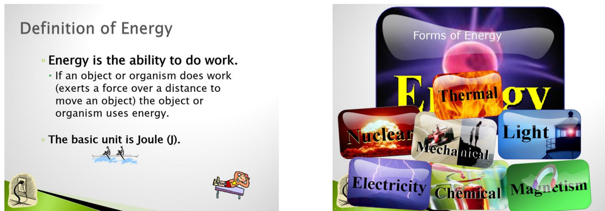
Figures 3 & 4: Sample slides from the content-instruction presentation

The language input focuses on the CDFs of “analysing” and “evaluating”. With the help of a presentation, certain words, phrases and grammatical features are introduced so that the students should be prepared to use these language patterns when talking about different sources of energy, their advantages/disadvantages and how they could be used sensibly and effectively in the 21 st century.